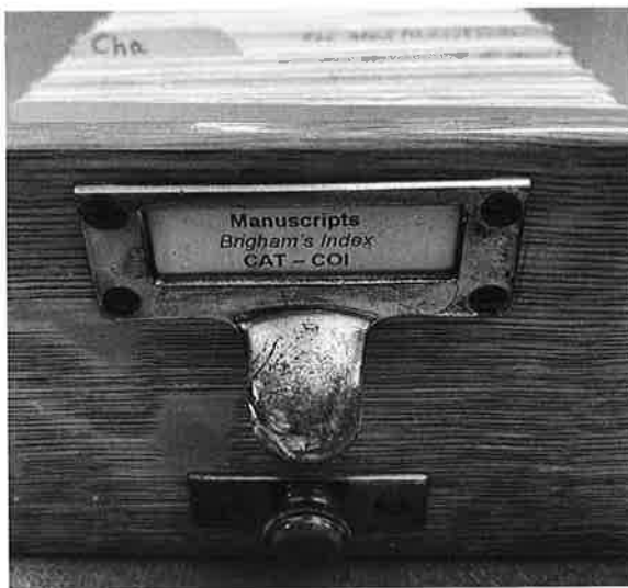
Single-folder manuscript catalog created by Loriman Bringham.